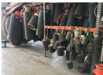
Pipe plugs, Vacuum, Joint & Mandrel Testers