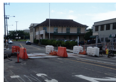
Flanged Road Crossings in a Range of Sizes