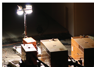
Diesel, Electric & Battery Powered Light Towers